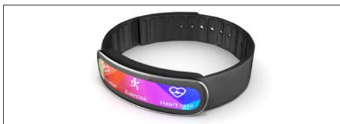
Wearables (Smart Watches, Health Monitors, AR & VR)