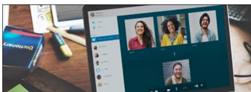
5G Networking/Telecommunications Communication Modules (WiFi Routers and Mesh Devices)