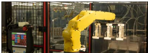
Industrial IoT / Robotics & Factory Automation